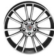
Diamond Cut Finish