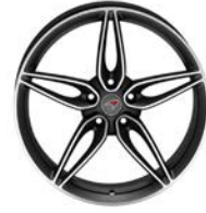
Diamond Cut Finish