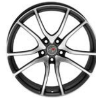
Diamond Cut Finish