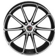
Diamond Cut Finish