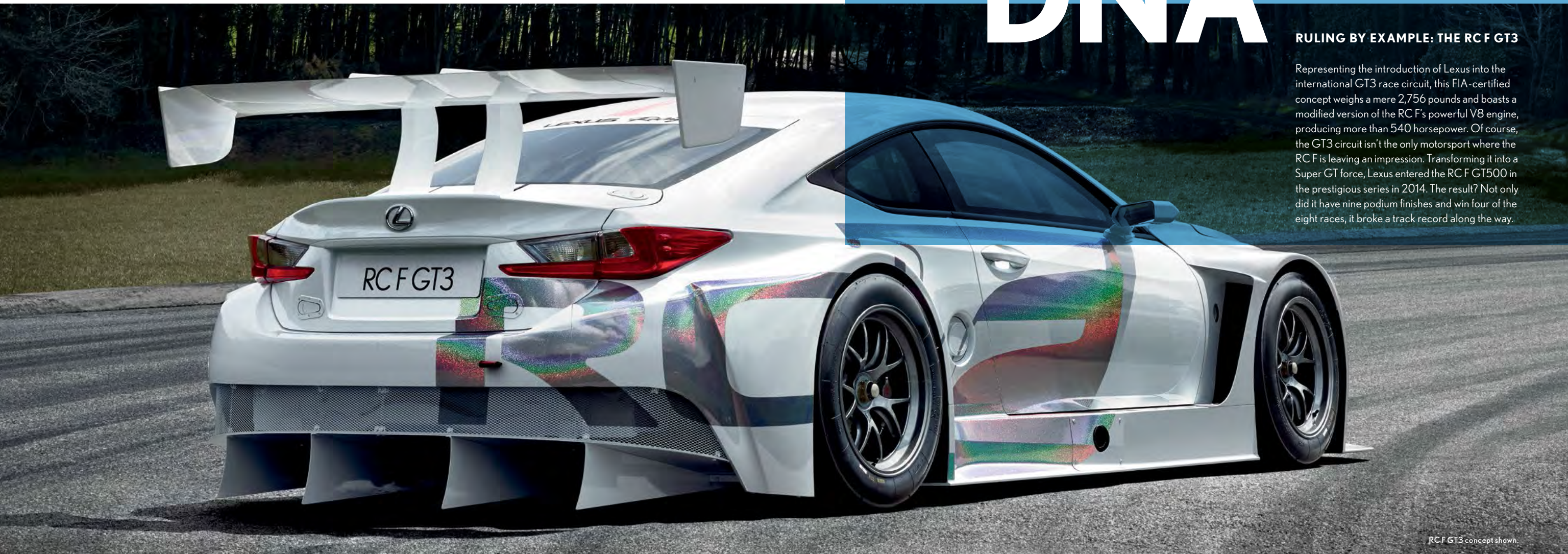
RC F GT3 concept shown.

Representing the introduction of Lexus into the international GT3 race circuit, this FIA-certified concept weighs a mere 2,756 pounds and boasts a modified version of the RC F's powerful V8 engine, producing more than 540 horsepower. Of course, the GT3 circuit isn't the only motorsport where the RC F is leaving an impression. Transforming it into a Super GT force, Lexus entered the RC F GT500 in the prestigious series in 2014. The result? Not only did it have nine podium finishes and win four of the eight races, it broke a track record along the way.