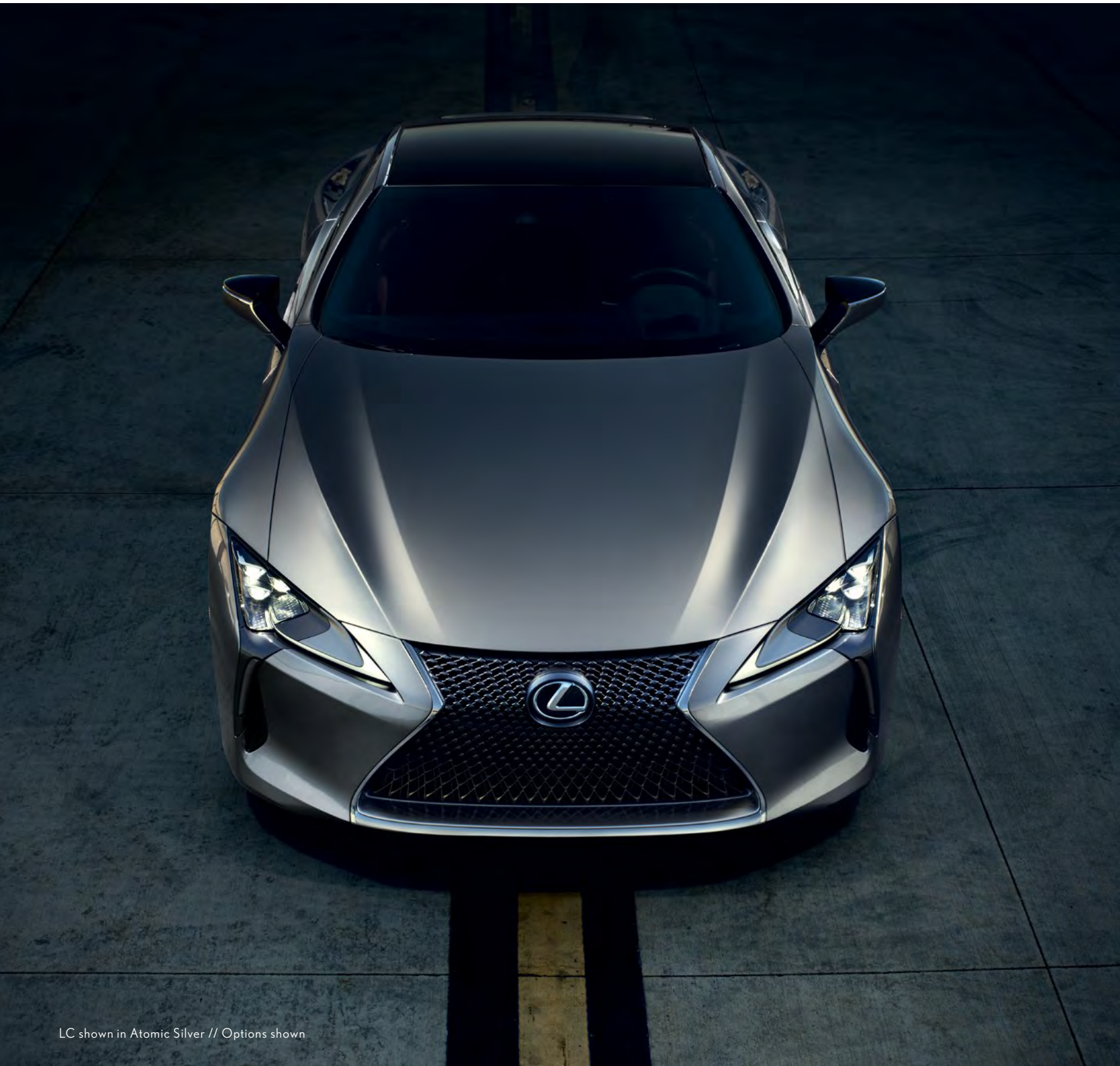
LC shown in Atomic Silver // Options shown