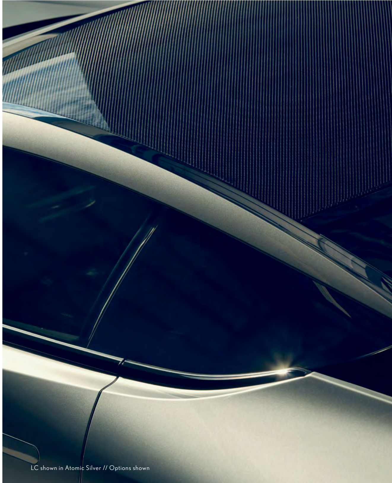
LC shown in Atomic Silver // Options shown