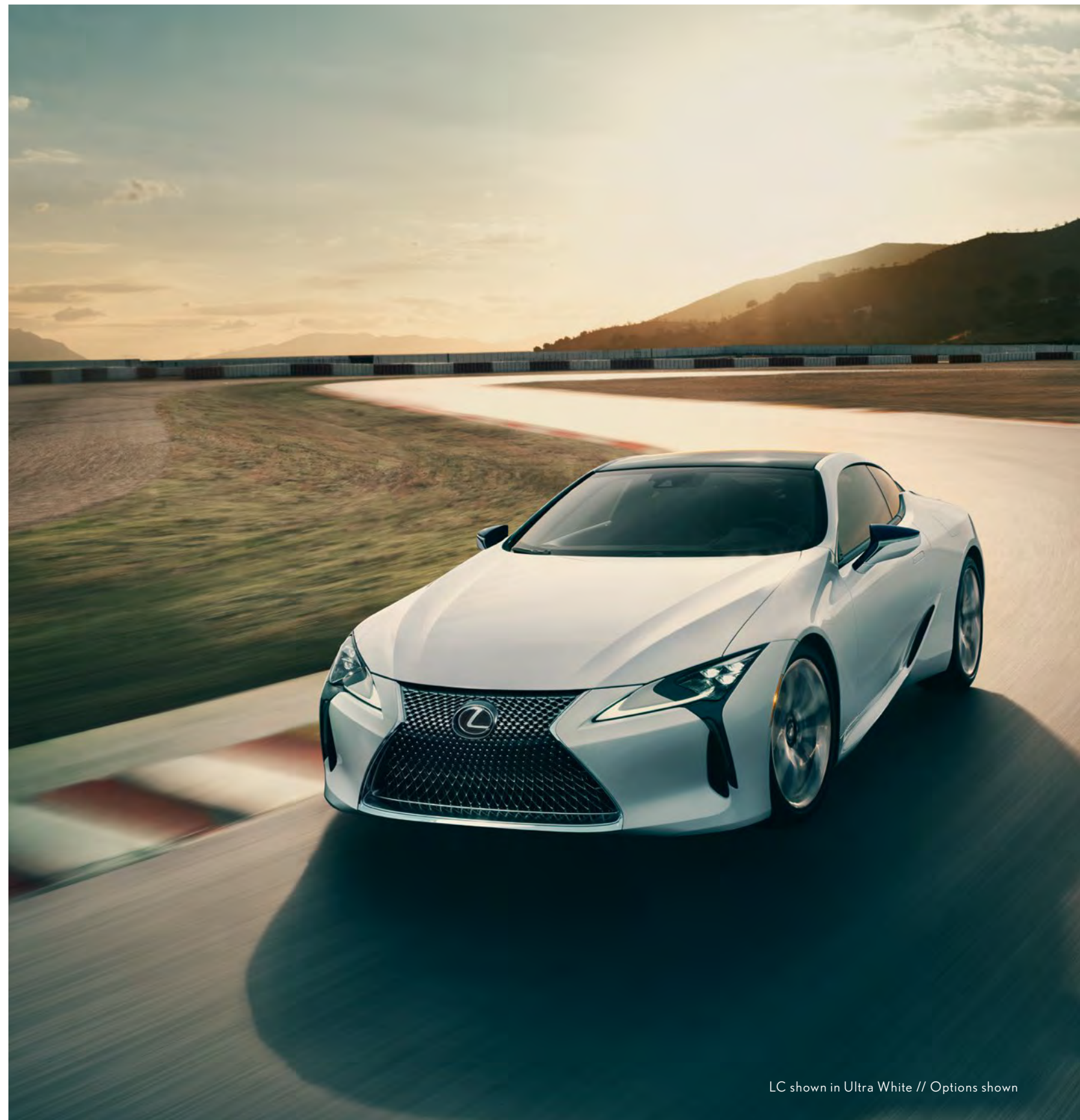
LC shown in Ultra White // Options shown