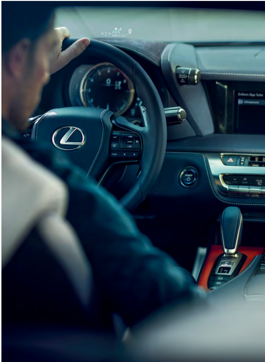
LC shown with Bespoke White leather interior trim // Options shown