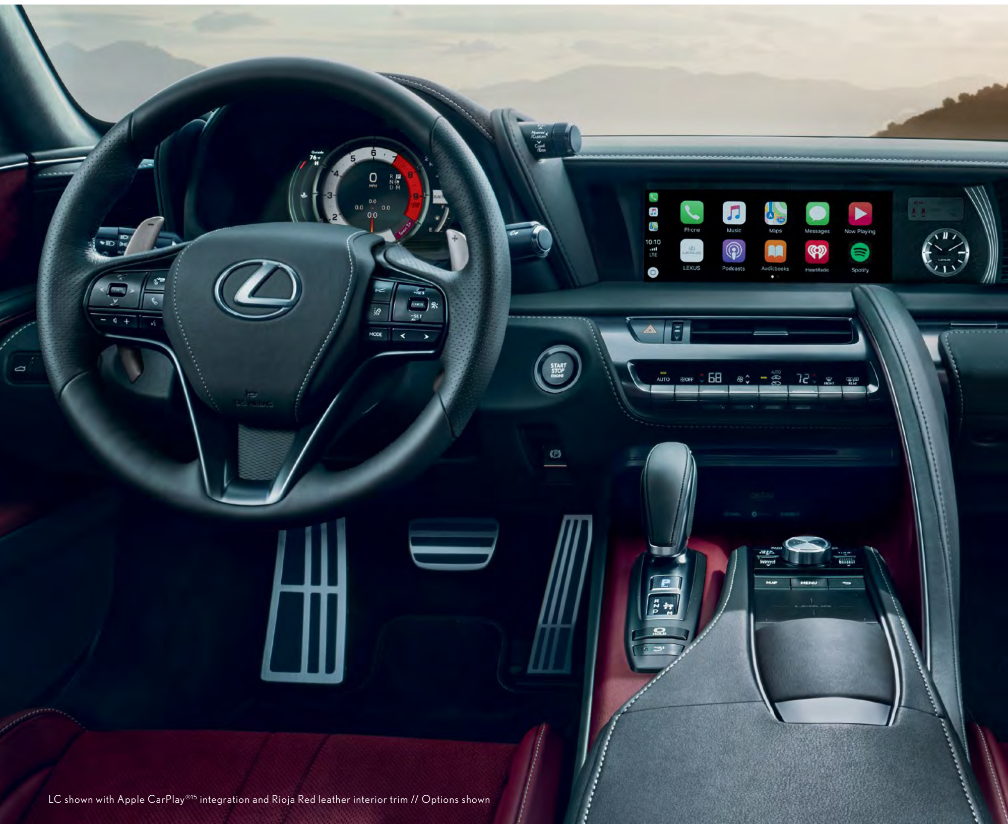
LC shown with Apple CarPlay ®15 integration and Rioja Red leather interior trim // Options shown