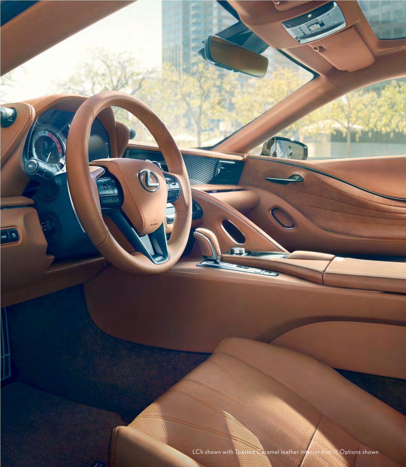
LCh shown with Toasted Caramel leather interior trim // Options shown