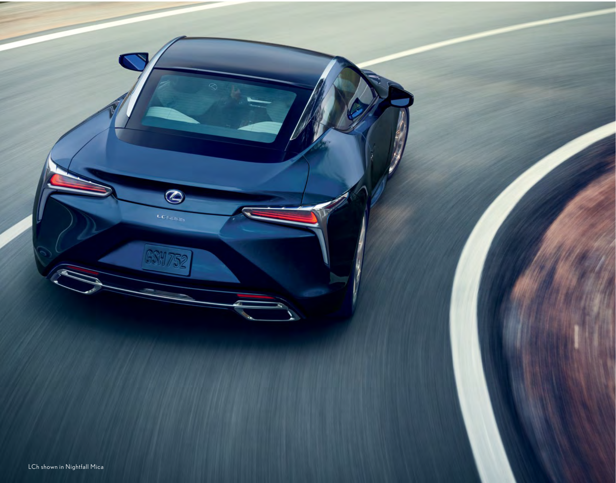
LCh shown in Nightfall Mica