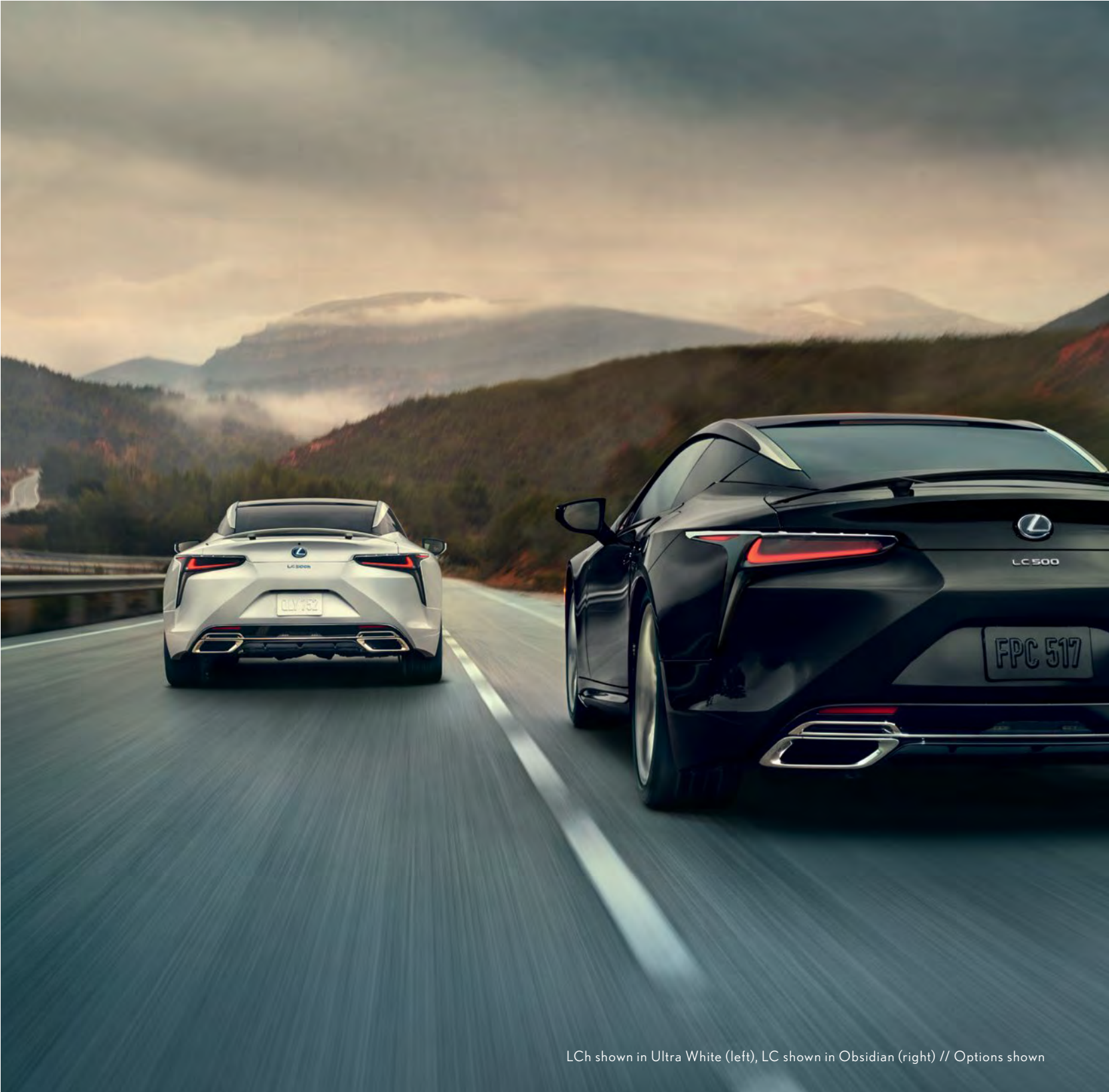
LCh shown in Ultra White (left), LC shown in Obsidian (right) // Options shown