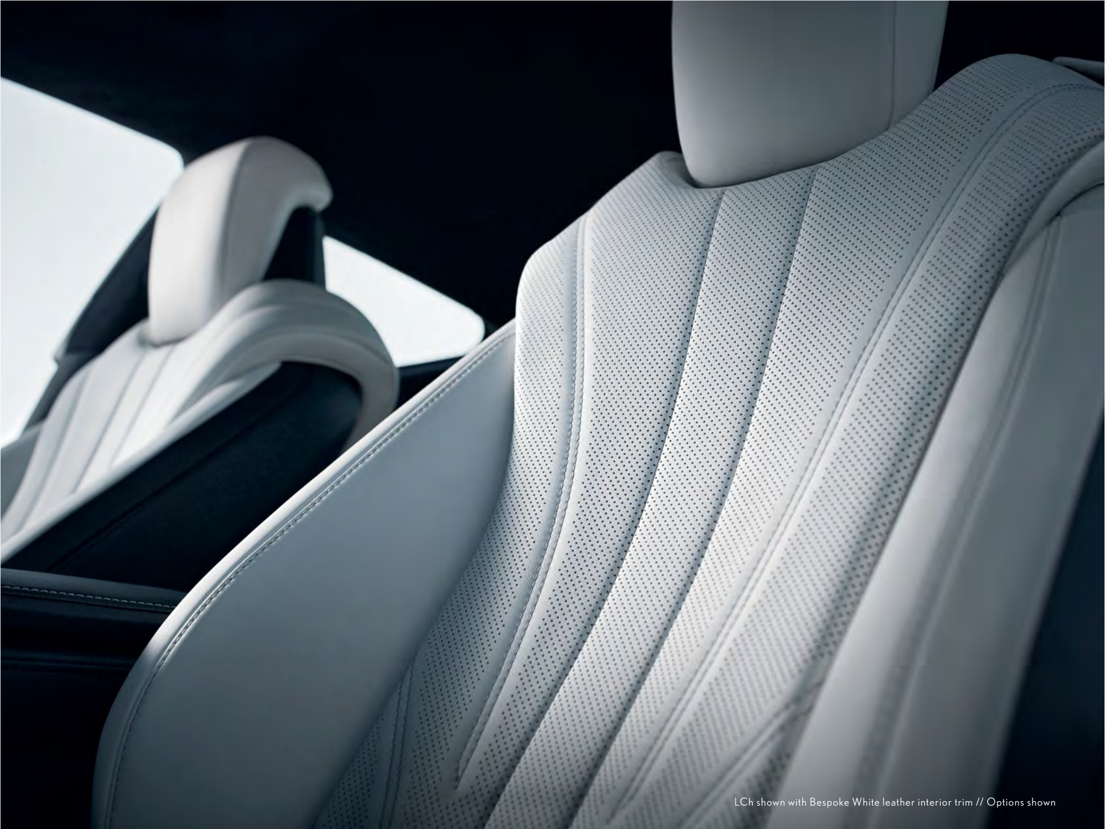
LCh shown with Bespoke White leather interior trim // Options shown

Experience iconic style with the available Touring Package. Semi-aniline leather-trimmed front seats with an Alcantara® 5 headliner, Mark Levinson® Reference Surround Sound Audio System, 7 and the choice of 20- or 21-inch forged alloy wheels 6 bring added refinement to our most polished coupe yet. While a Blind Spot Monitor 8 with Rear Cross-Traffic Alert 9 and Intuitive Parking Assist 10 offer added convenience and peace of mind.