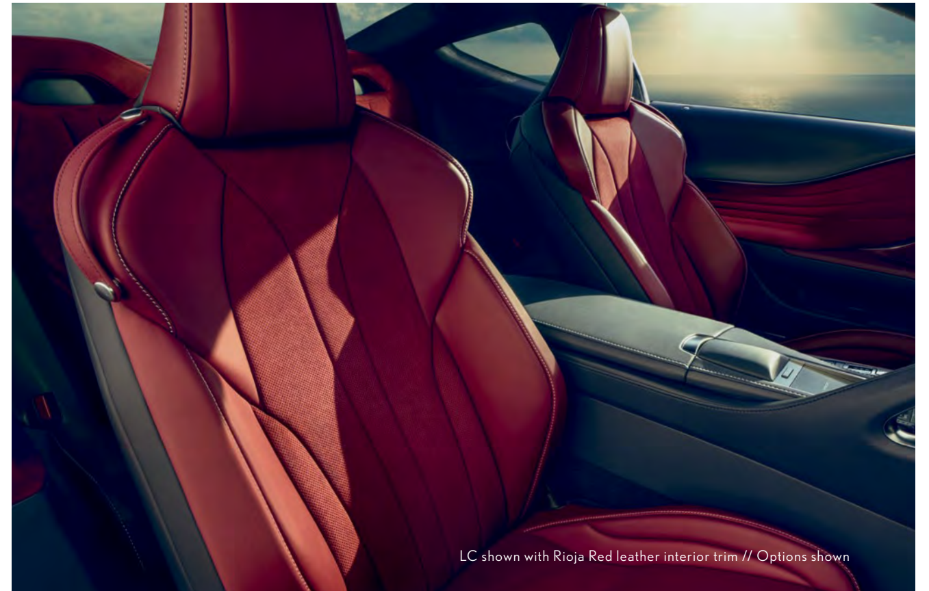
LC shown with Rioja Red leather interior trim // Options shown

For a higher level of performance, the Sport Package offers advanced track-developed features like a TORSEN® limited-slip differential 11 (LC 500) that distributes engine power to the rear axle for optimized traction. Alcantara® 5 -trimmed sport seats with eight-way power support are specially engineered for high-G cornering and circuit driving. The high-back seats are designed to help maintain the ideal posture, and the textured leather trim helps grip the driver's back—even against significant lateral G-forces. The available Sport Package also offers a glass or carbon fiber roof, lightweight forged alloy wheels, Intuitive Parking Assist, 10 and Blind Spot Monitor 8 with Rear Cross-Traffic Alert. 9