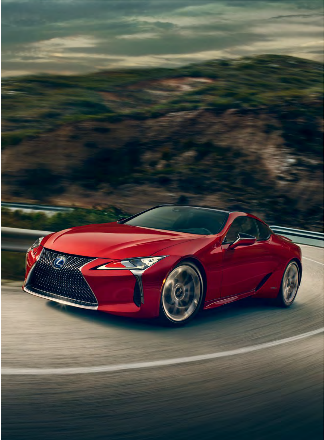
LCh shown in Infrared 3 // Options shown

Our most powerful creation is more than a car. It's a feeling.