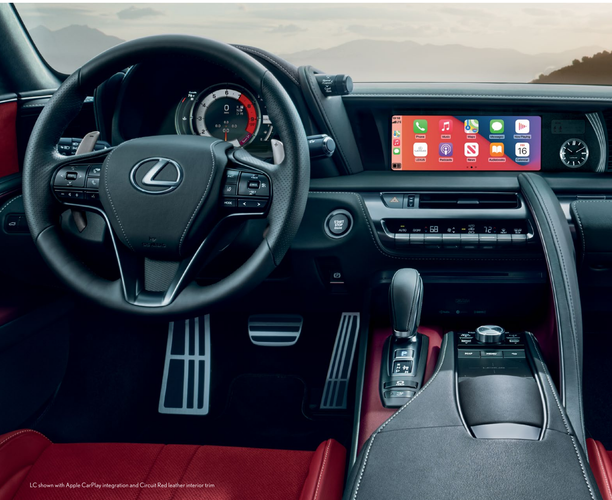
LC shown with Apple CarPlay integration and Circuit Red leather interior trim