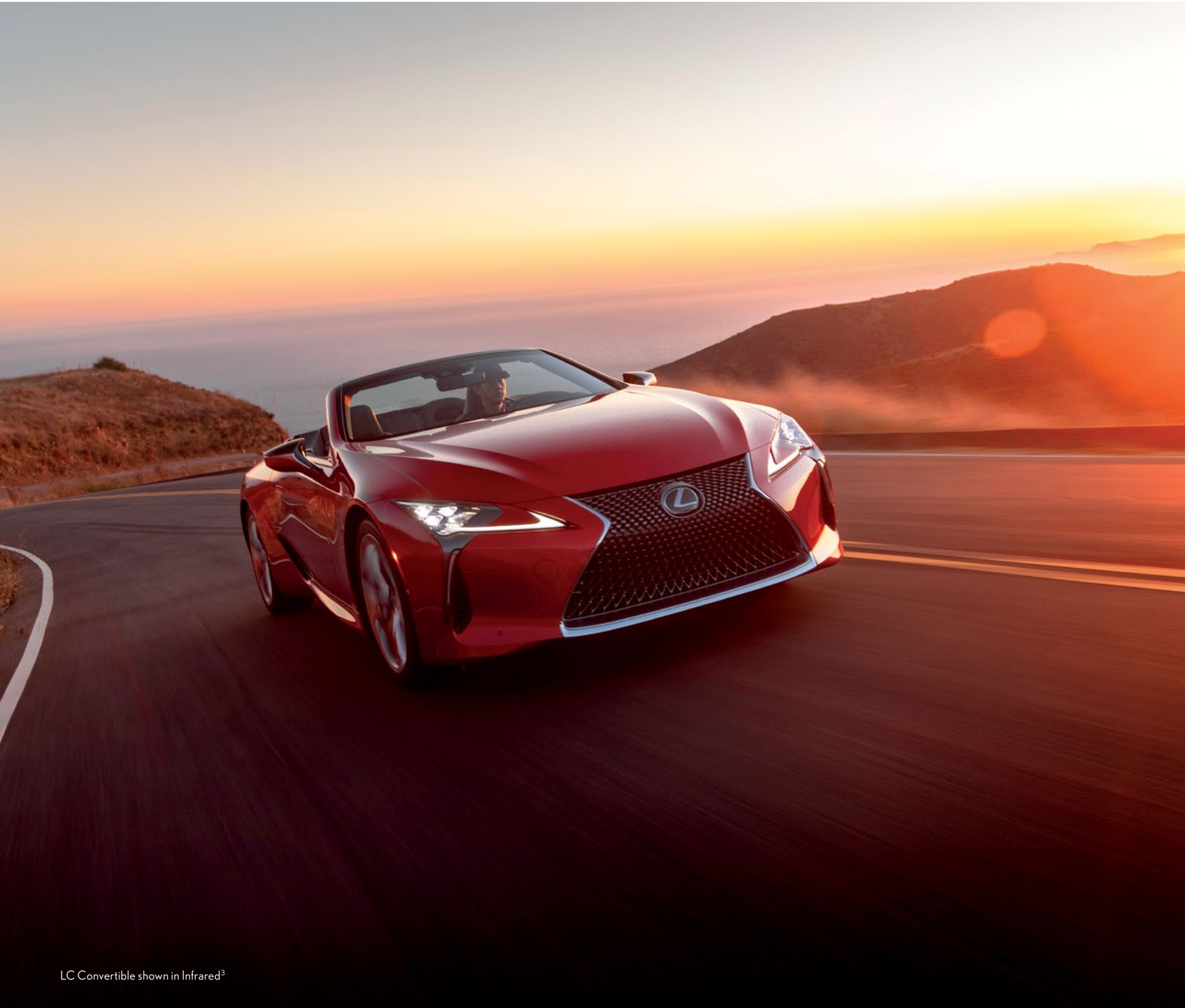
LC Convertible shown in Infrared 3