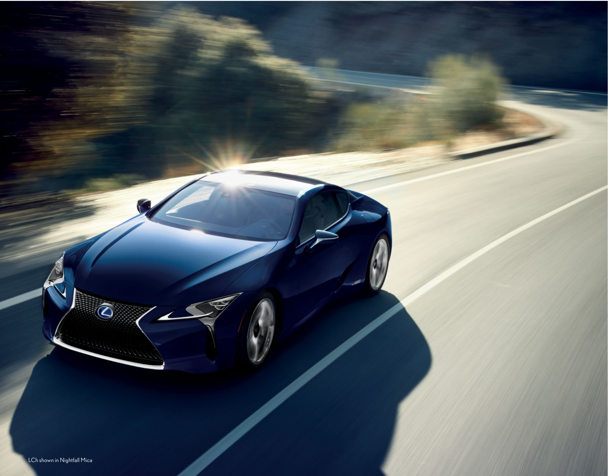
LCh shown in Nightfall Mica