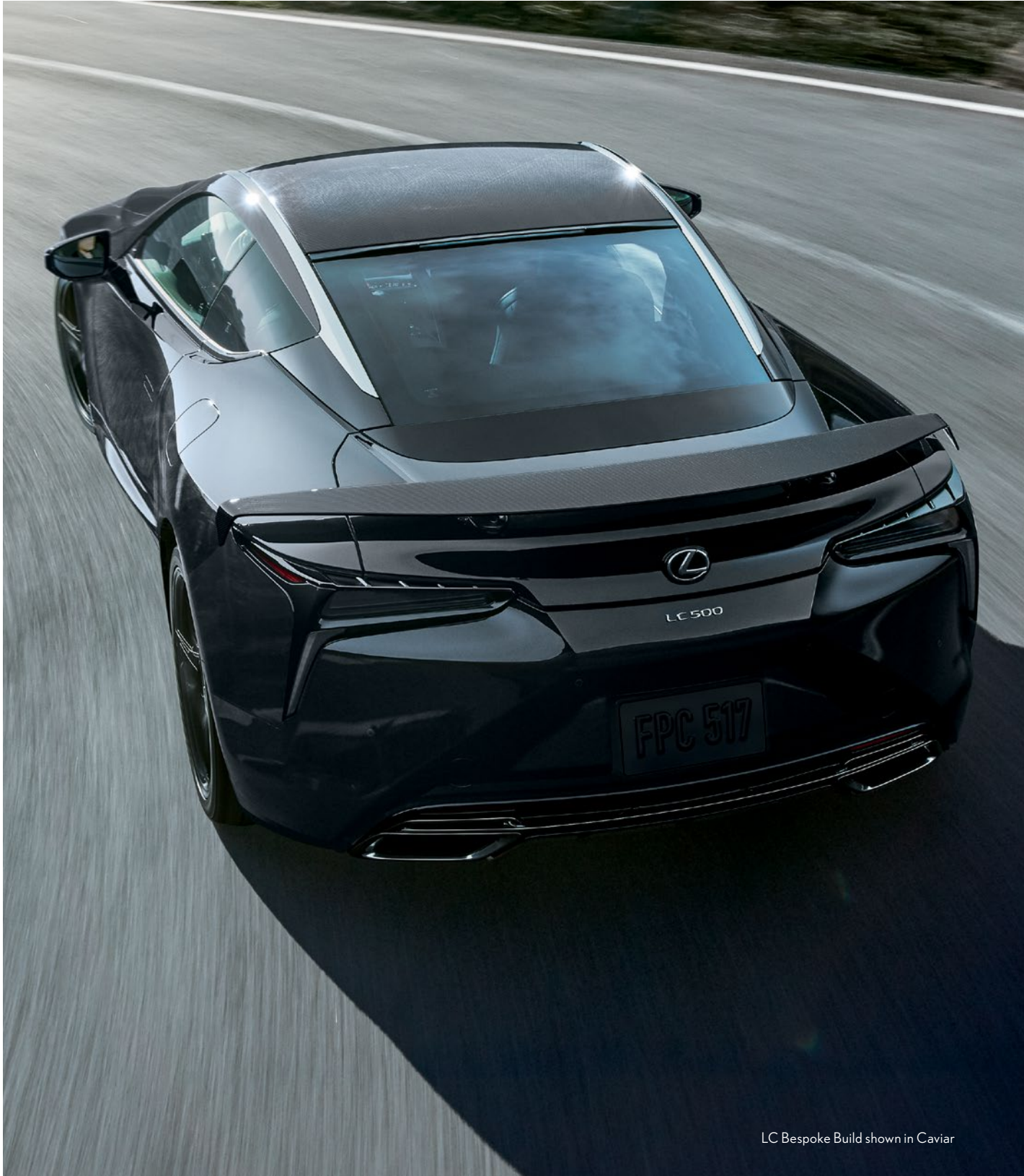
LC Bespoke Build shown in Caviar