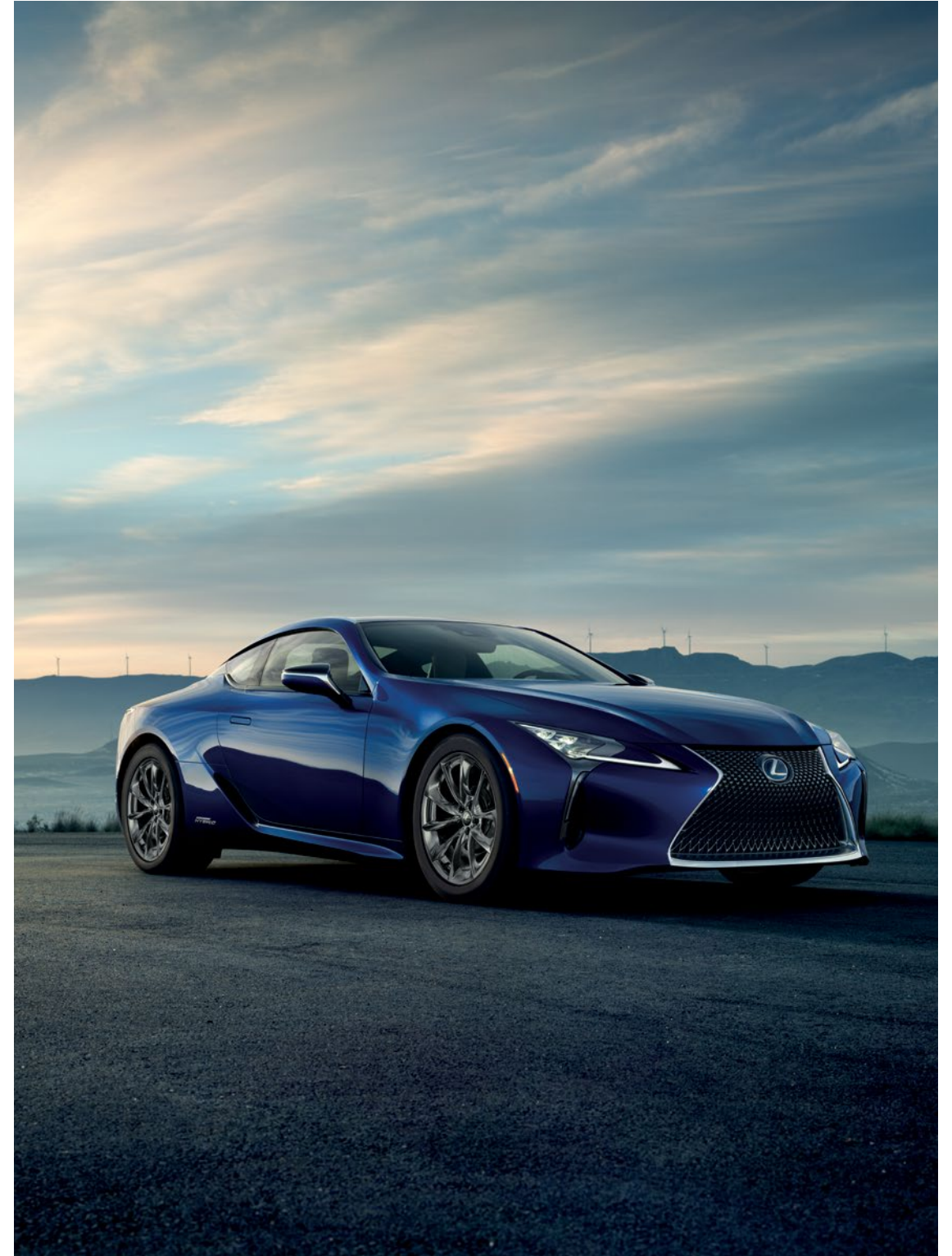
LCh shown in Nightfall Mica

From the new customizable Bespoke Build coupe to the thoughtful details you'll discover in the incomparable LC Convertible, every element is designed to elicit a response from the driver.