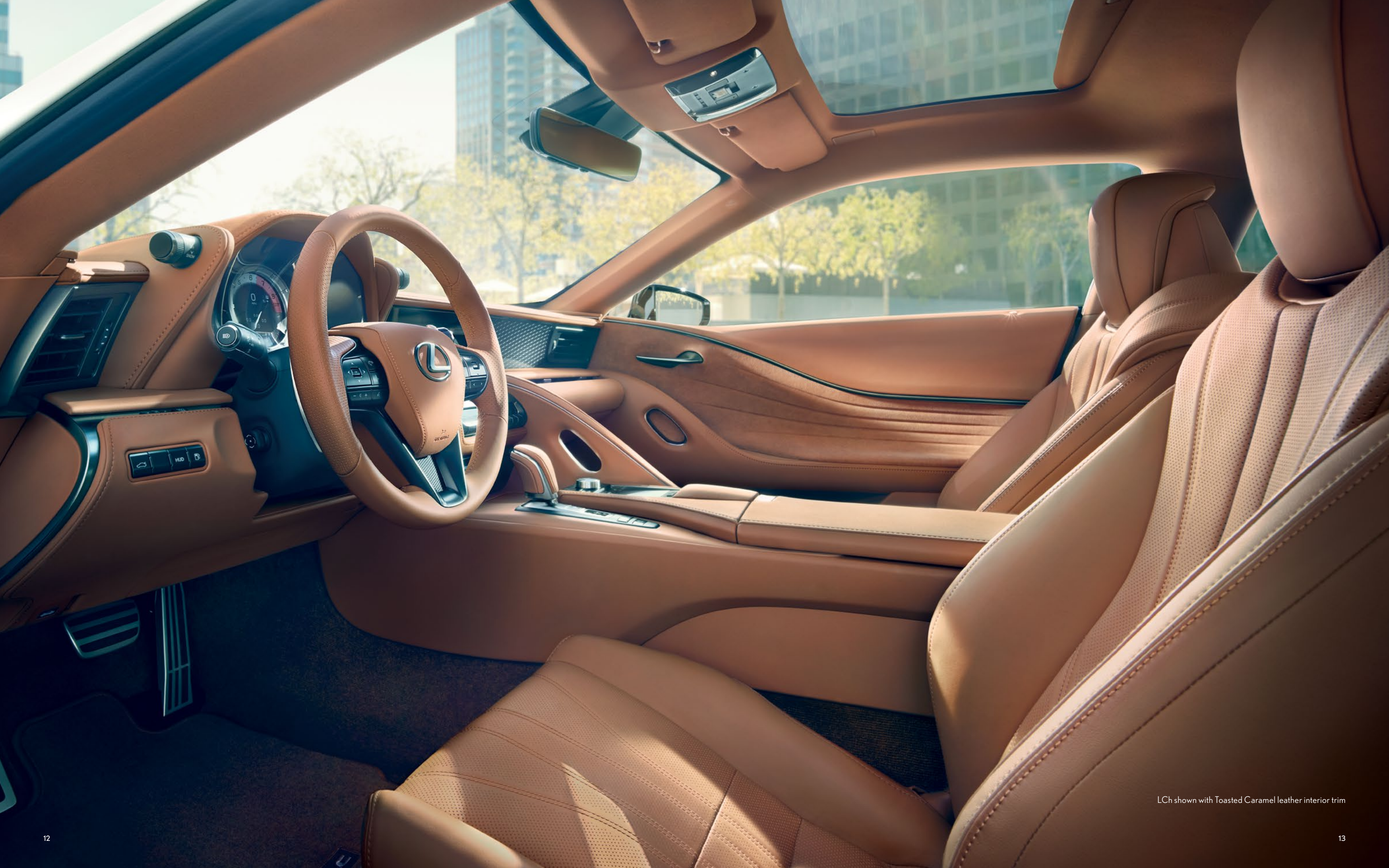
LCh shown with Toasted Caramel leather interior trim