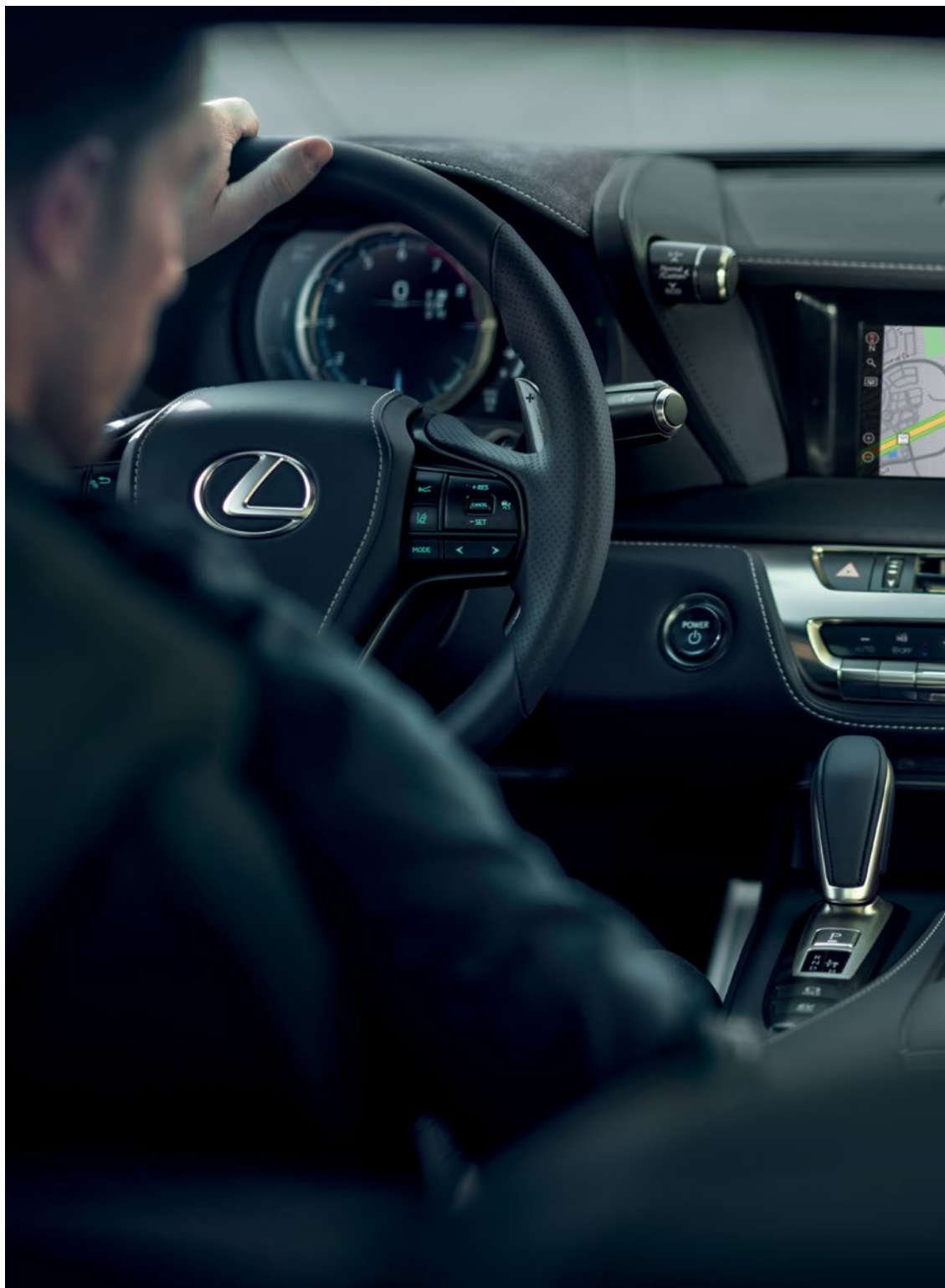
LC shown with Black leather interior trim