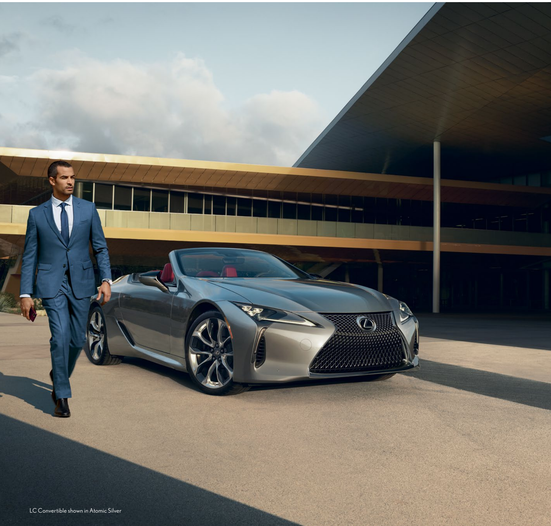
LC Convertible shown in Atomic Silver