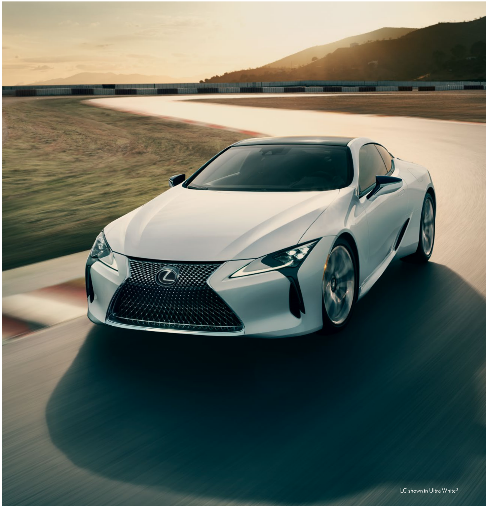
LC shown in Ultra White 3