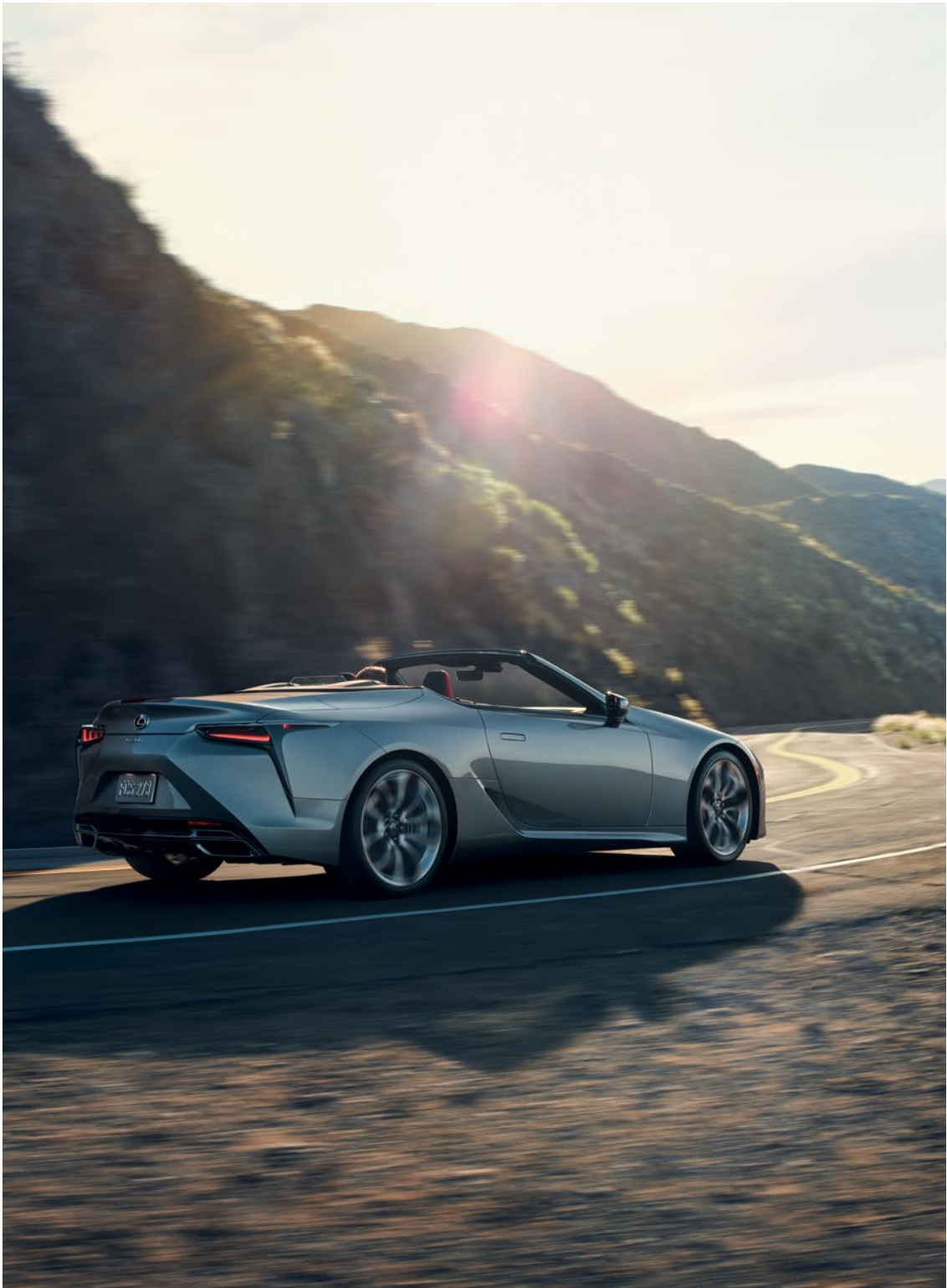
LC Convertible shown in Atomic Silver