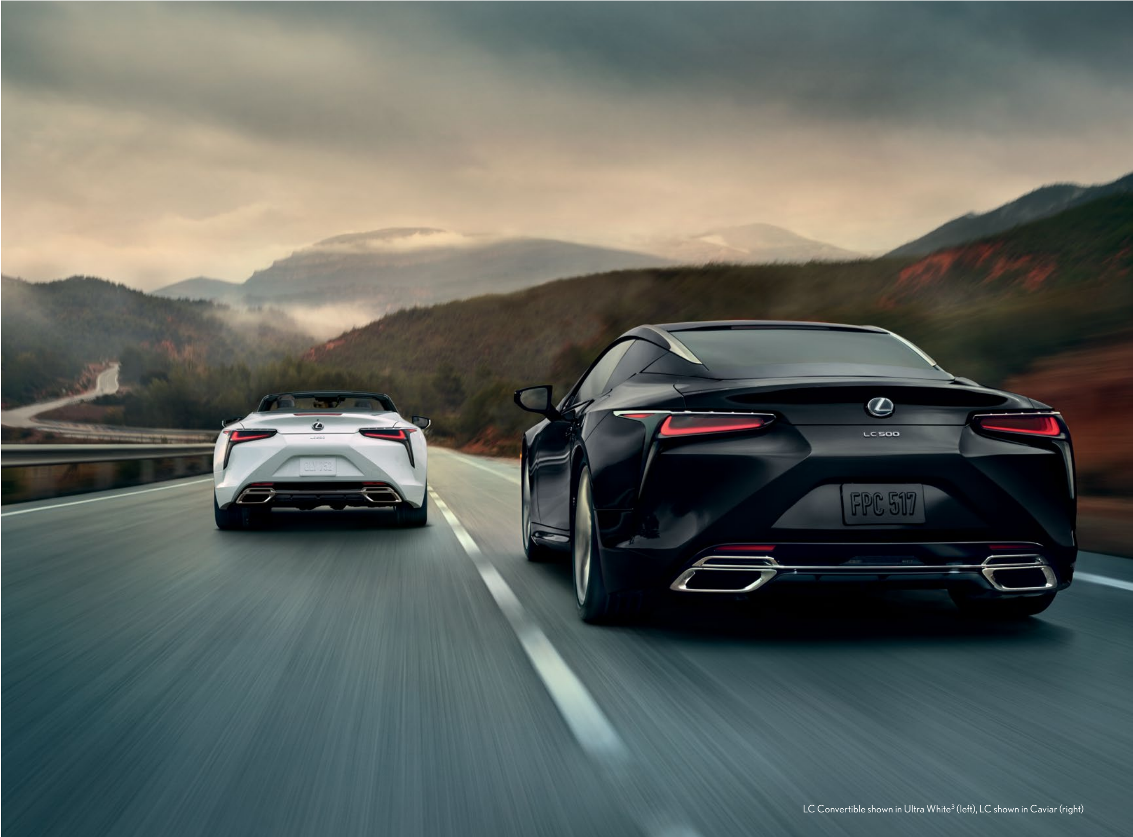
LC Convertible shown in Ultra White 3 (left), LC shown in Caviar (right)

A 10-speed Direct-Shift automatic transmission with magnesium paddle shifters was specifically designed for the LC. It has one of the fastest shift times among conventional automatic transmissions, changing gears in 0.12 seconds. Or, half the time it takes the average human to blink. The system also learns your habits every time you drive, selecting the optimum gear based on vehicle speed, acceleration and your driving style—even choosing the ideal gear while cornering.