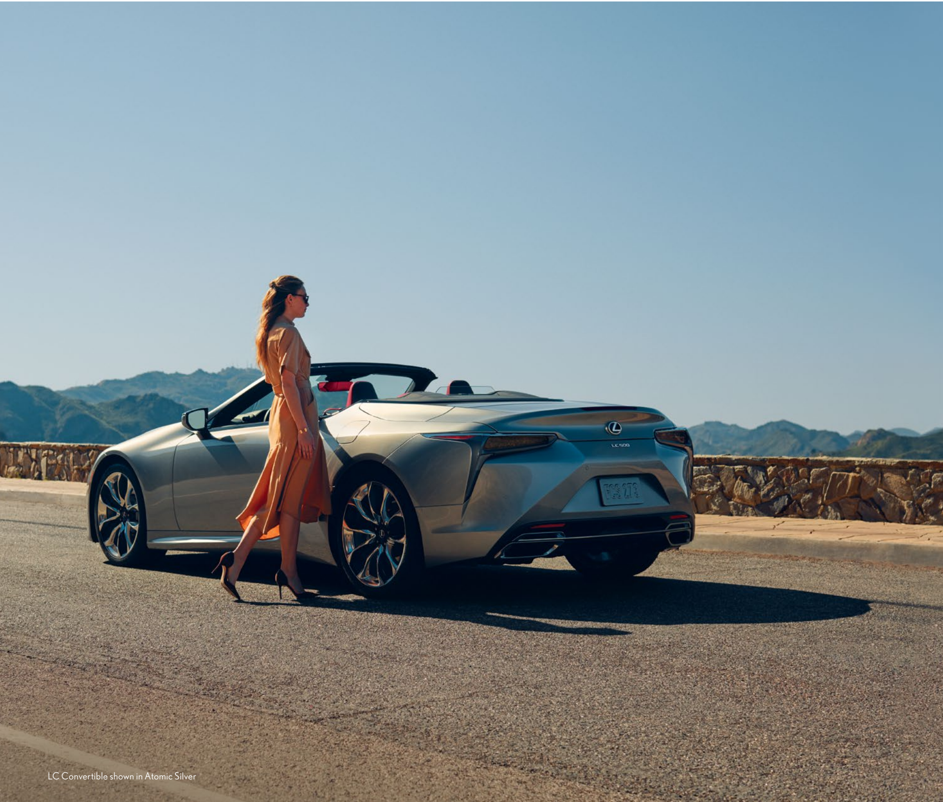
LC Convertible shown in Atomic Silver