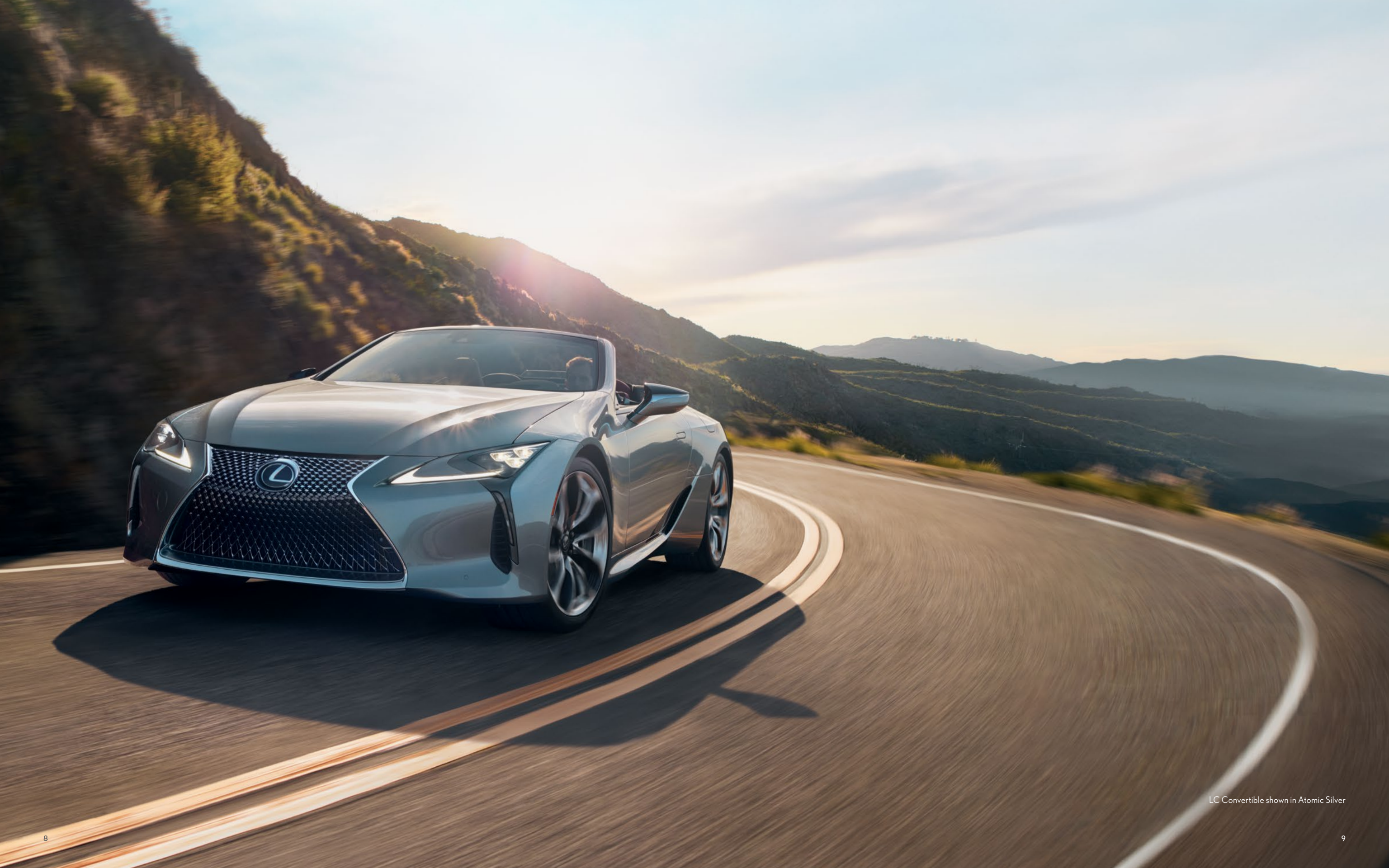
LC Convertible shown in Atomic Silver